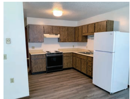
Town & Country Kitchen