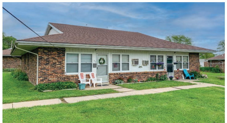
Town & Country Apartments Exterior