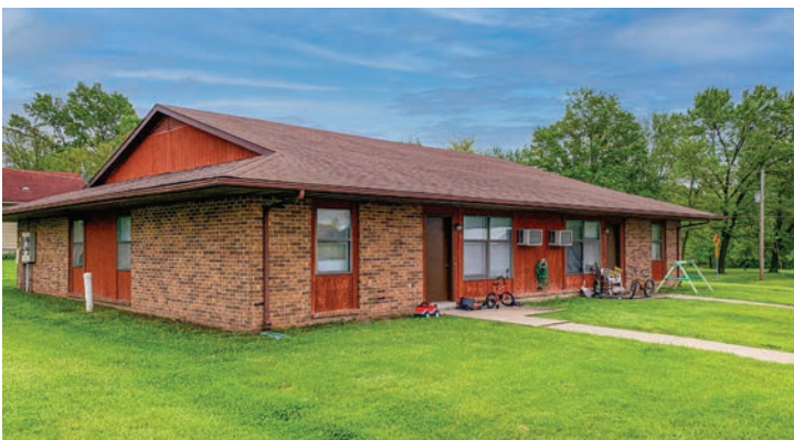
Rosewood Apartments Exterior